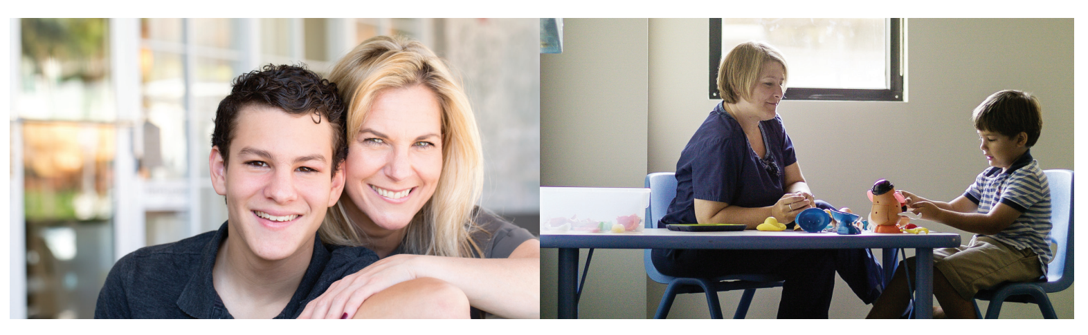
$500 Art Therapy for a child receiving therapy in one of our Behavioral Health Clinics.

$1,000 Technological Upgrades to provide enhanced mobile access to our in-home solutions teams to provide more effective solutions to our kids and families.